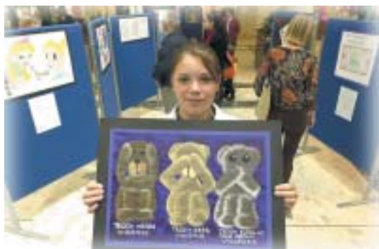
Young people from secondary schools in Melbourne's east produced art work on the impact of family violence on young people. The 'Seen and not hurt' exhibition was displayed at Knox Shopping Centre in Melbourne.

This year has seen the development of a strong community partnership between the Anglicare Victoria Rosebud Youth Program and the Rye Sailing Club. The Youth Out There Sailing Program was launched at the Club in November by round the world lone sailor Jessie Martin. Young people attending Anglicare Victoria Rosebud have gained new skills in all areas of development from their sailing experience since the launch.