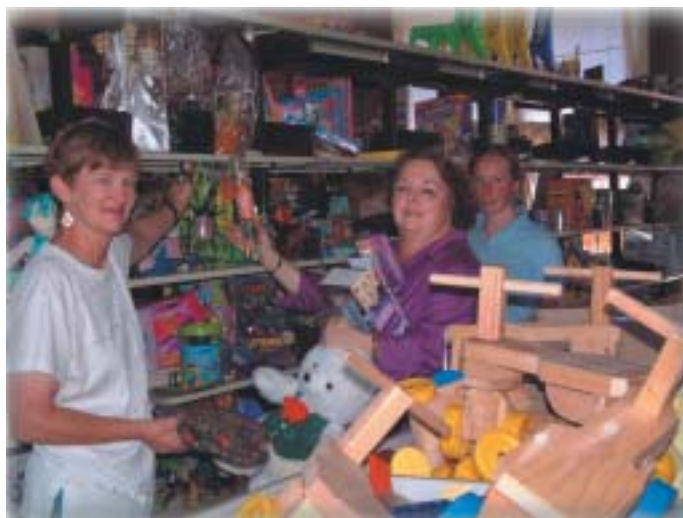
Anglicare's Annual Food and Toy Appeal distributed thousands of food parcels and toys to children and families in need over the Christmas period.

Anglicare Victoria's Gippsland region co-ordinated a forum in July on community development attended by over 120 people. The "Building the Future" forum was held in partnership with the Diocese of Gippsland and featured a wide range of speakers who have contributed to local and regional projects, including the Toora Community Bank, McKillops Bridge quilt project, learning circles, and neighbourhood renewal.