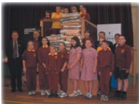
Local students help launch Anglicare in Gippsland's annual winter appeal in June.

Family Services in Anglicare Victoria's Northern region introduced the Darebin Supporting Vulnerable Families Innovation Project. This partnership is between Anglicare Victoria, Children's Protection Society, Kildonan Youth & Family Services and City of Darebin. The core component of the new service is the establishment of a central point of intake for families with multiple and complex needs.