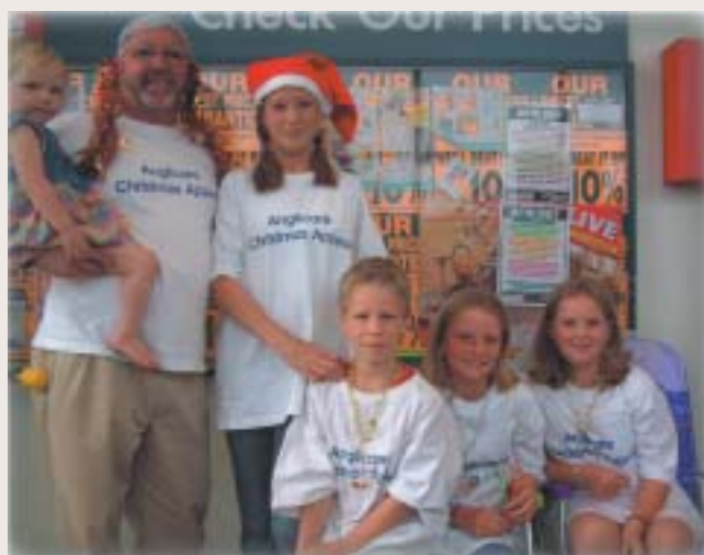
1200 volunteers assisted Anglicare's Annual Christmas Appeal in the sale of angel decorations and pens through 174 Bunnings Warehouses and schools, parishes and local businesses.