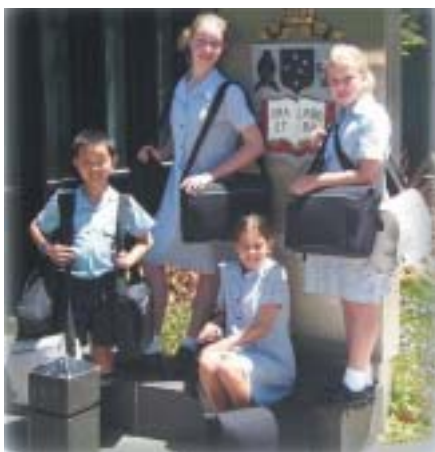
During the year, Grade 5 students at Melbourne Grammar Junior School developed a 'Welcome To Resi' pack for children entering residential care for the first time.

Anglicare Victoria was successful in obtaining funding through Best Start Maribyrnong for a mentoring program for new parents living in Yarraville. This is a 12 month project, which will be expanded into other local areas, including Braybrook and Sunshine. The Financial Counselling group education program at the Melbourne Assessment Prison has also expanded.