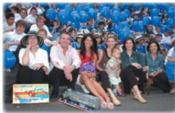
Anglicare Victoria's Christmas Toy Appeal was officially launched on the steps of Parliament House in Melbourne on 18 November 2003.