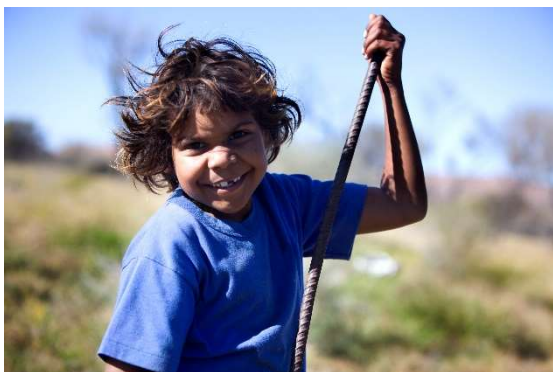
Happy reading from the Parentzone Southern team