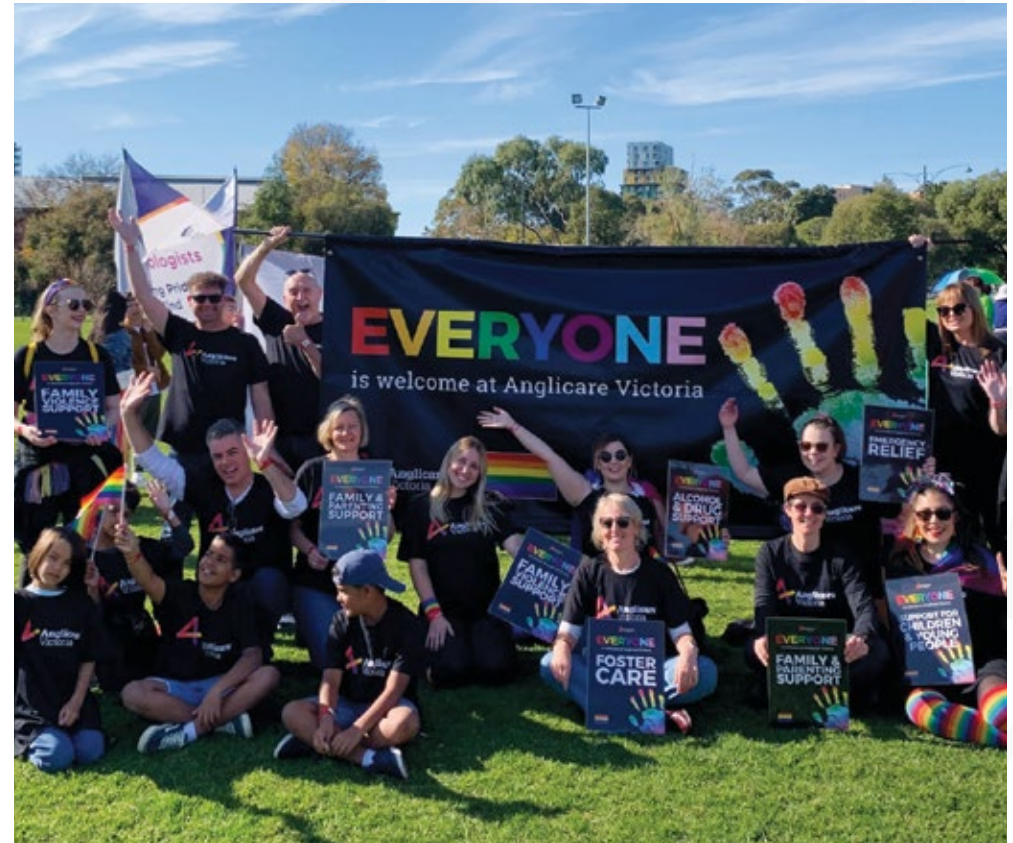
Anglicare Victoria staff at the 2021 Midsumma Pride March