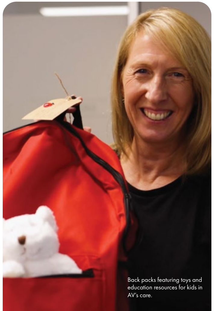
Back packs featuring toys and education resources for kids in AV's care.

“The turn out for this year’s event was just fantastic. Especially after COVID-19, people are wanting to give back to those less fortunate than themselves. We’re already looking forward to doing this again – it’s going to be bigger and better next year!”