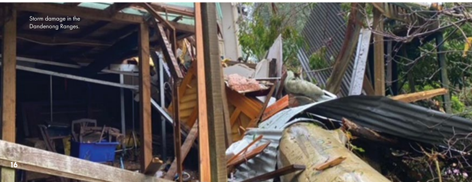
Storm damage in the Dandenong Ranges.

Committed to staying for the long-term to help residents get back on their feet and resume their everyday lives, our Disaster Recovery team will continue to work with residents until the end of 2022.