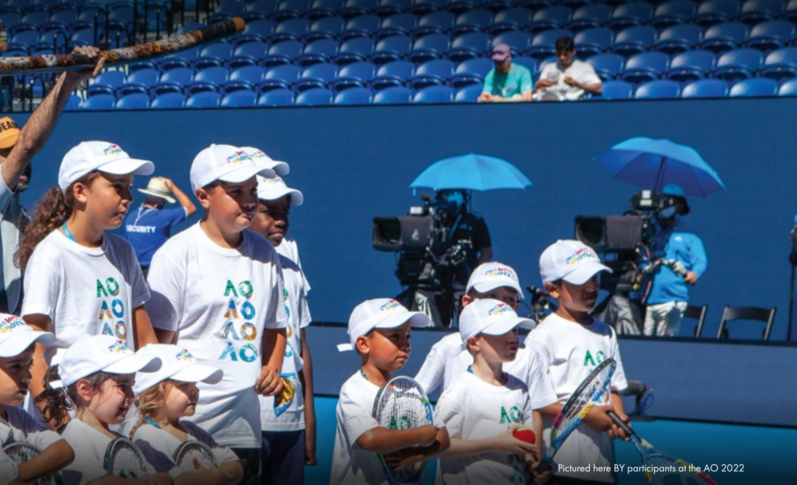
Pictured here BY participants at the AO 2022