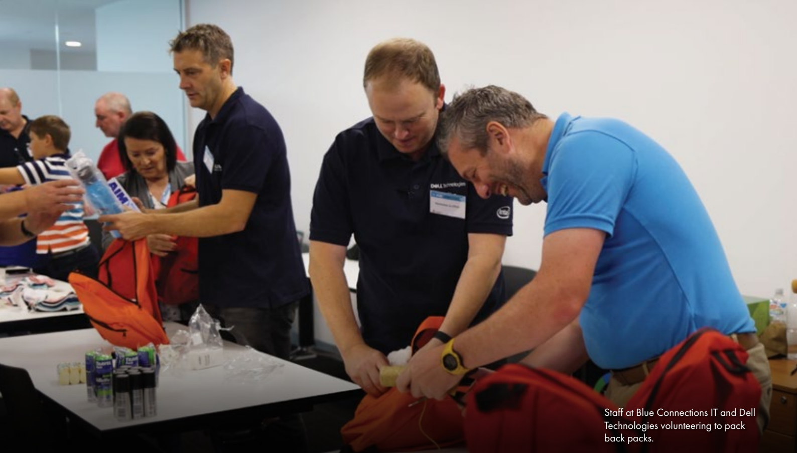
Staff at Blue Connections IT and Dell Technologies volunteering to pack backpacks.