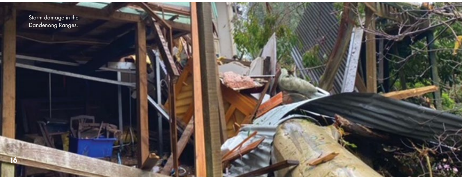
Storm damage in the Dandenong Ranges.

Committed to staying for the long-term to help residents get back on their feet and resume their everyday lives, our Disaster Recovery team will continue to work with residents until the end of 2022.