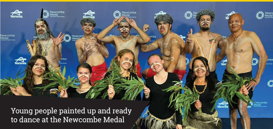
Young people painted up and ready to dance at the Newcombe Medal